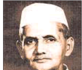
Lal Bahadur Shastri