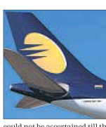
Jet Airways flight 9W 536, which departed from Mumbai at 12:45 hrs for Dubai, was diverted to Muscat due to a bomb threat.

The Oman authorities cleared the Jet Airways flight for take off to Dubai around 9 pm.