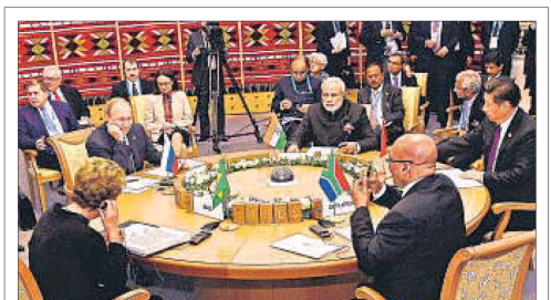
PM Narendra Modi with other world leaders at the BRICS summit in Ufa, Russia, on Thursday.