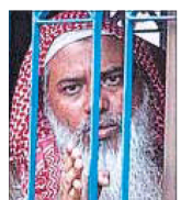
Siddique ul-Islam, alias Bangla Bhai (above), travelled across Bengal between 2005 and 2006, before being executed in Bangladesh in 2007.

With the discovery of the role played by Bangla Bhai, it has now become clear that efforts to spread the JMB's roots in India